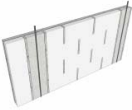
Hybrid Block Wall