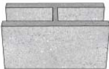
1-Web H Block