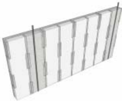
3-Web Block Wall